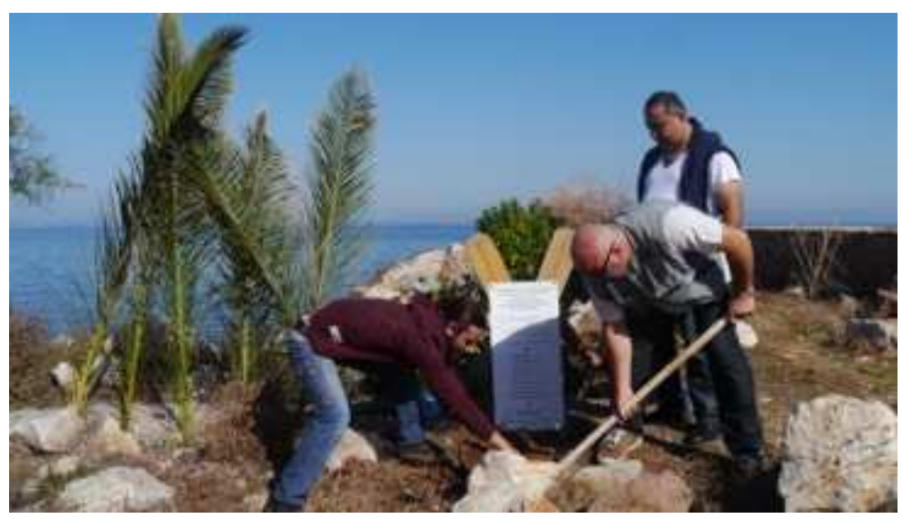
Family members of the dead build the memorial with us.

December 2012, 27 people were found dead in Thermi. On the 14th in the afternoon a 16-year-old unaccompanied minor from Afghanistan was rescued by Frontex in the sea near Lesvos. He had been on a boat with more than 30 others and their dinghy got into distress in the night of the 14th/15th. The next day three dead people were found in Thermi . Only after that the Greek coast guard started a search and rescue operation to look for further survivors. During the next days more and more dead people were found at the beaches of Thermi - in total 27 bodies. Some remained missing. Their names we don't know, but many of them are