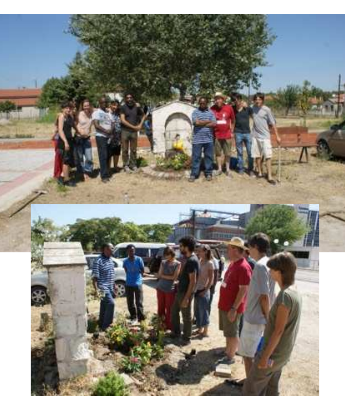
A few months later "unknown" vandals destroyed the memorial in Evros. Unfortunately we never heard anything from the local authorities who had so much appreciated our idea.