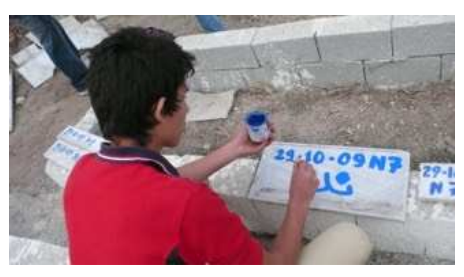
Writting the names of his lost mother and siblings for the graves...