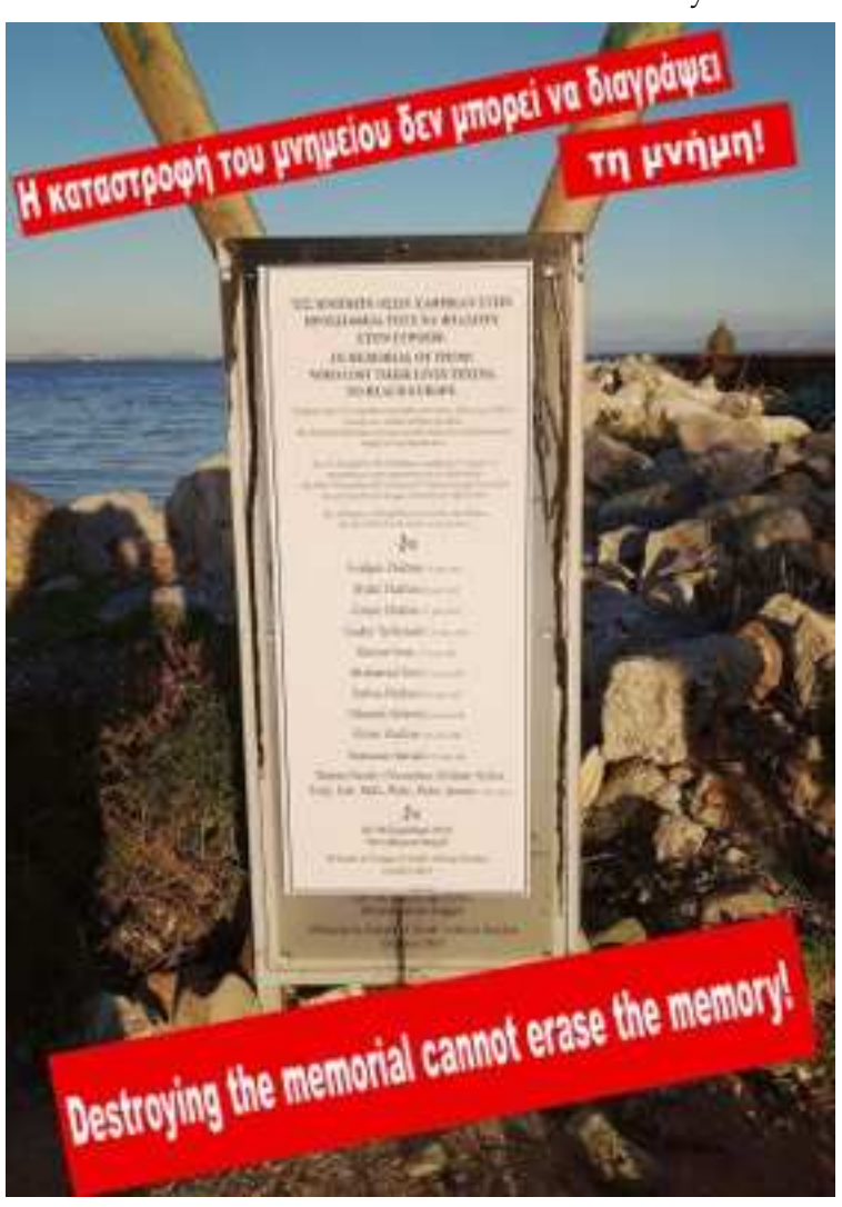
LESVOS 2018- Thermi – Memorial twice destroyed.

The memorial in Thermi was destroyed in August 2018 by fascists who proudly announced it in an anonymous call to a local newspaper. But destroying a memorial can not erase the memories of the people and we will continue building up memorials and keeping the names alive and will not stop until these murderous borders disappear.